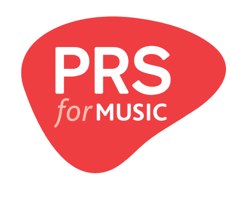
Gender Pay Gap Report